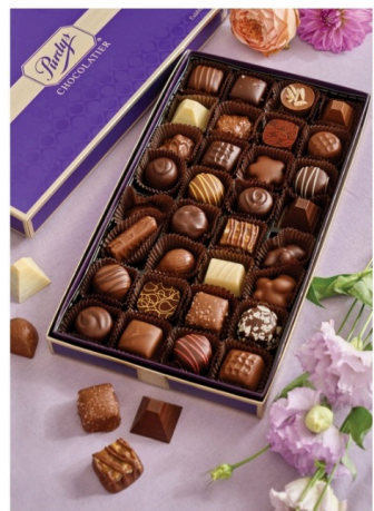
GIFT WRAPPED Favourites A premium assortment of caramels, soft centres, and chocolate-covered nuts, of decadent indulgence for Easter. 1205G Assorted 32 pc $42.50 1303G Milk 32 pc $42.50 1303G Dark 32 pc $42.50