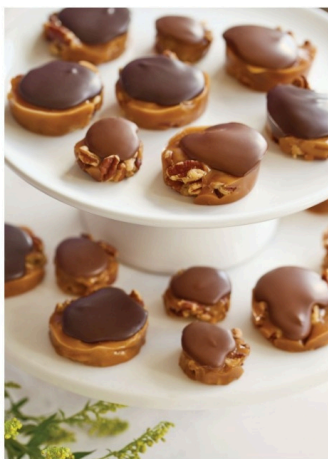
GIFT WRAPPED Sweet Georgia Browns A heavenly trio of crunchy roasted pecans, unbelievably soft caramel and a generous dollop of chocolate. 1000E Milk 8 pc $28.90 1000G Milk (mini) 16 pc $28.90 1000G Dark 8 pc $28.90

Our Fundraising Sub Committee is hosting a Purdy's Chocolates Initiative for families who are interested in purchasing chocolates in preparation for the Easter season. If you are interested in purchasing chocolates in support of technology, please visit School Cash Online. The Purdy's Chocolates item will open on School Cash on March 3rd, and will close on March 28th. Delivery will be before the Easter break! Thank you in advance for supporting this initiative.